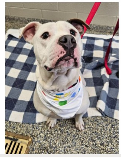
Students created bandanas to help our furry friends at Lollipop Farm find their forever homes.