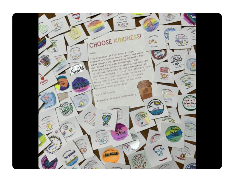
Kindness stickers for a local coffee shop