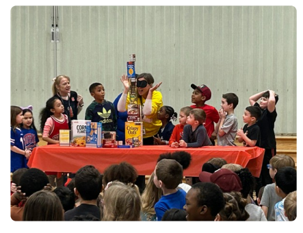
Brasser Way assembly featuring a stacking challenge our tower might have fallen, but our teammates showed compassion to one another!