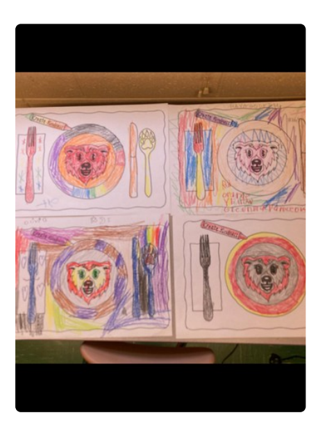
Kindergarteners made placemats for our friends at the Senior Center.