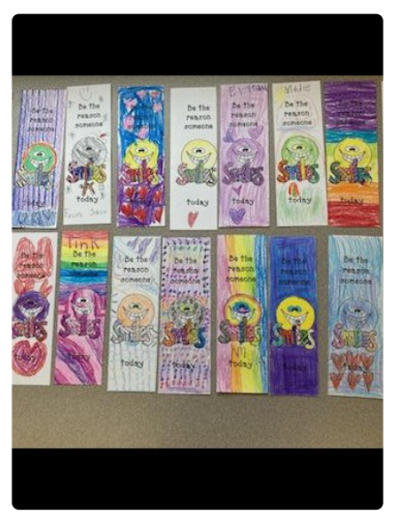
Bookmarks with special messages on them for the local library